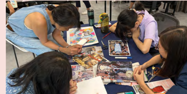
Crea Open Studio.