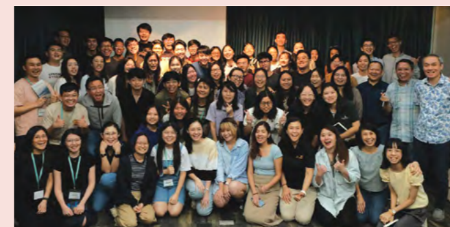
SEND: a LeaderImpact and Campus Ministry partnership to equip graduating students.