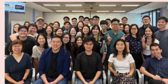
SMU Cru Grill a Christian outreach.