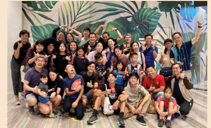
Fun outing with our volunteers and their families at Jewel Changi Airport.