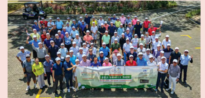
Cru Singapore's inaugural Golf Charity Drive.