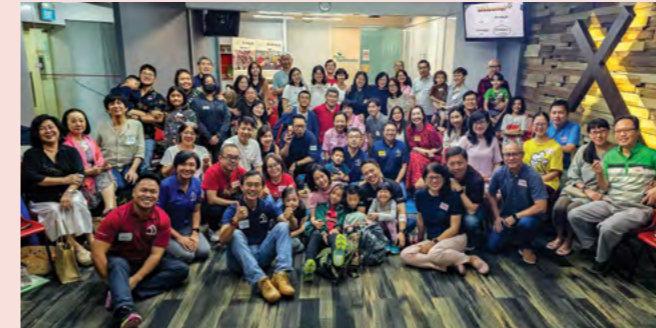
FamilyLife thanksgiving event.