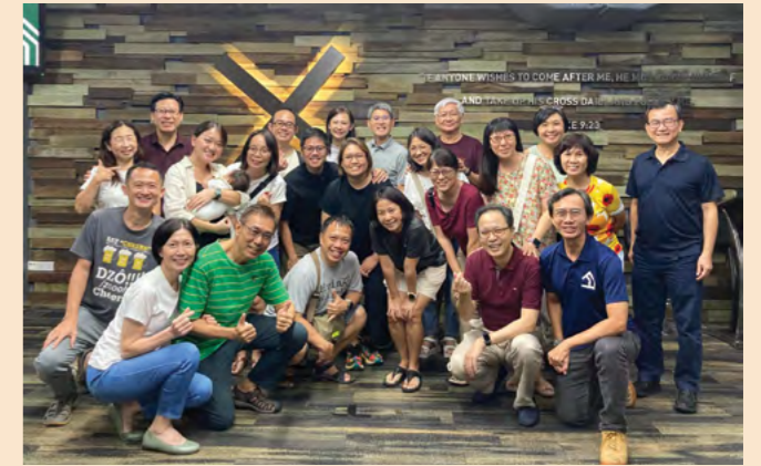
Monthly meeting with AOM volunteers.

"On behalf of FamilyLife, I would like to express our deepest thanks to the many volunteers who have