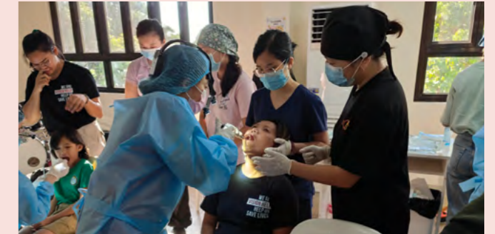
Healthcare Ministry mission team providing dental services at an orphanage in Manila.