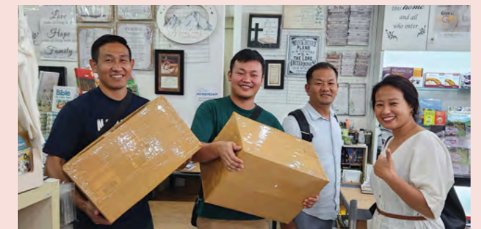
Media Ministry's Grabook donation to Miracle Worchum Ministry in India.