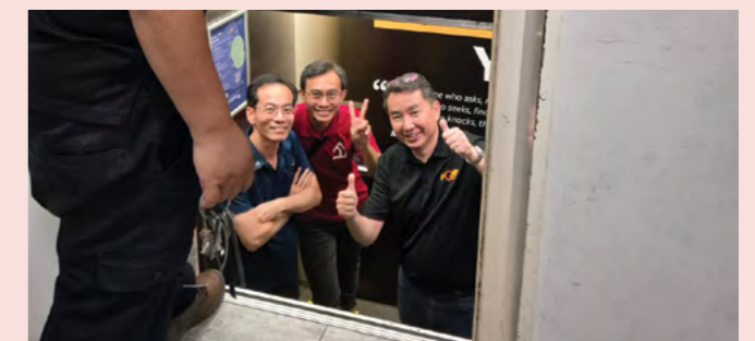
Operations team to the rescue—our lift is back and ready for use.