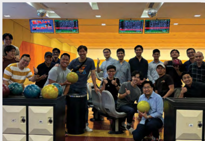
Men's Ministry bonding over bowling.