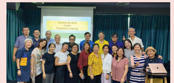
The Significance Project facilitators' training.