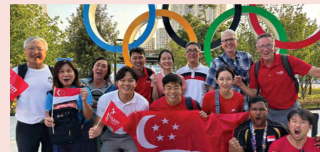
Athletes in Action team at the Paris Olympics.