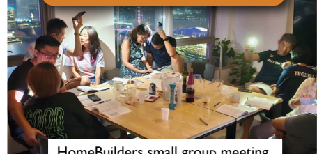
HomeBuilders small group meeting