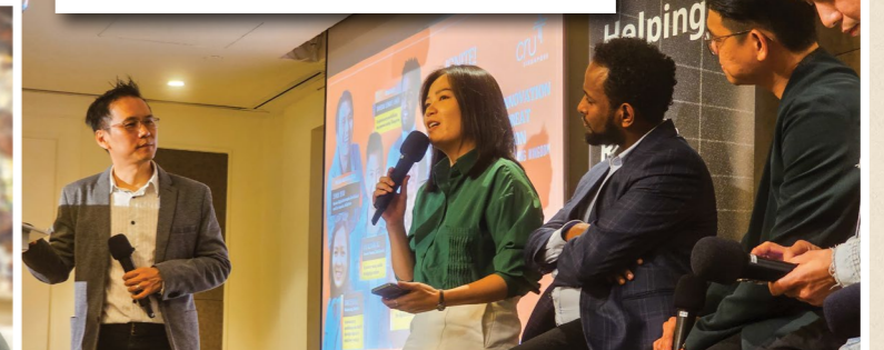
Panel interview at Ignite! Gathering (Digital Strategies)