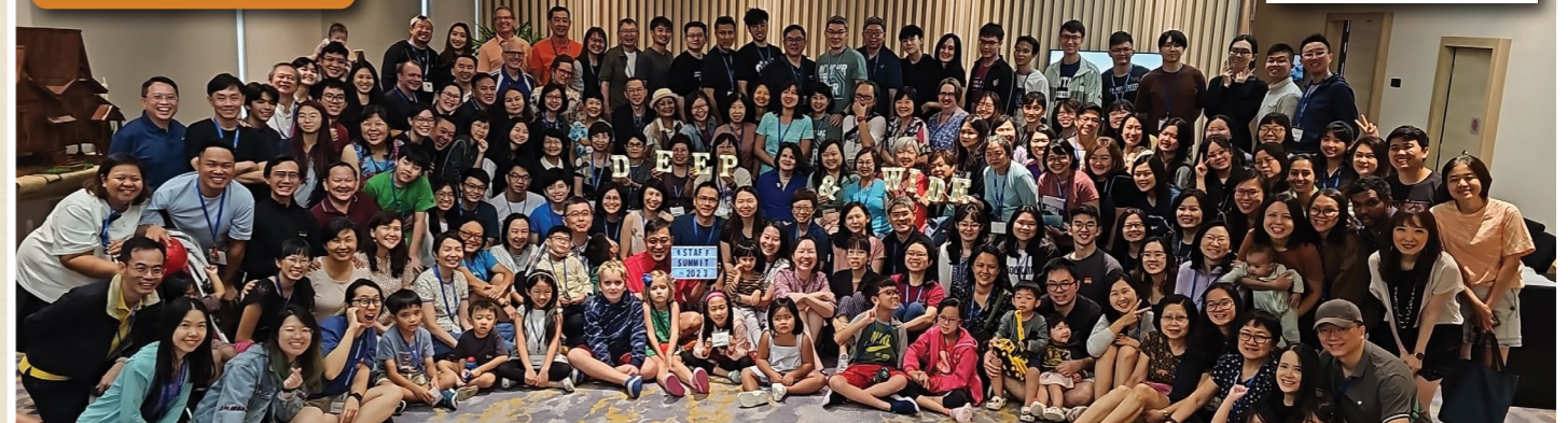
Cru Singapore staff family