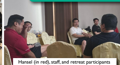
Hansel (in red), staff, and retreat participants sharing how God is leading them to step up in their marriages and families.