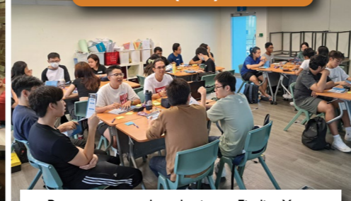
Peer group member sharing at Finding Your Purpose (FYP) Course at Singapore Polytechnic