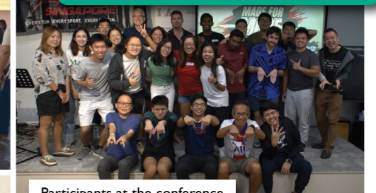
Participants at the conference