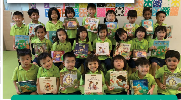
Helping to establish a library for Zion Bishan Kindercare by donating resources