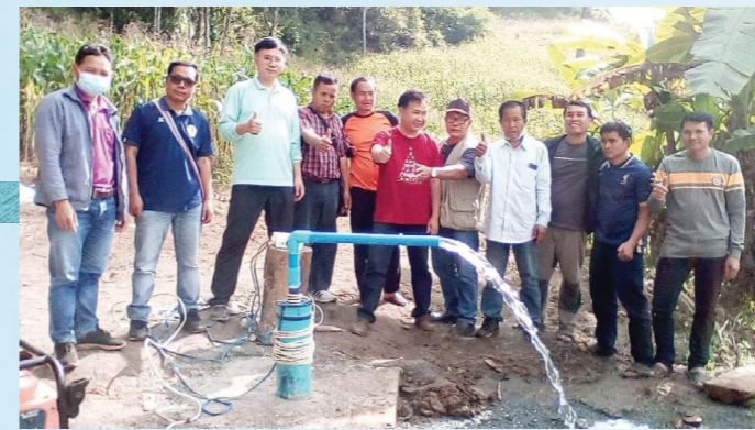
Water well successfully built to provide clean water to the village