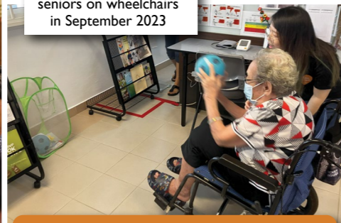
Game carnival for seniors on wheelchairs in September 2023